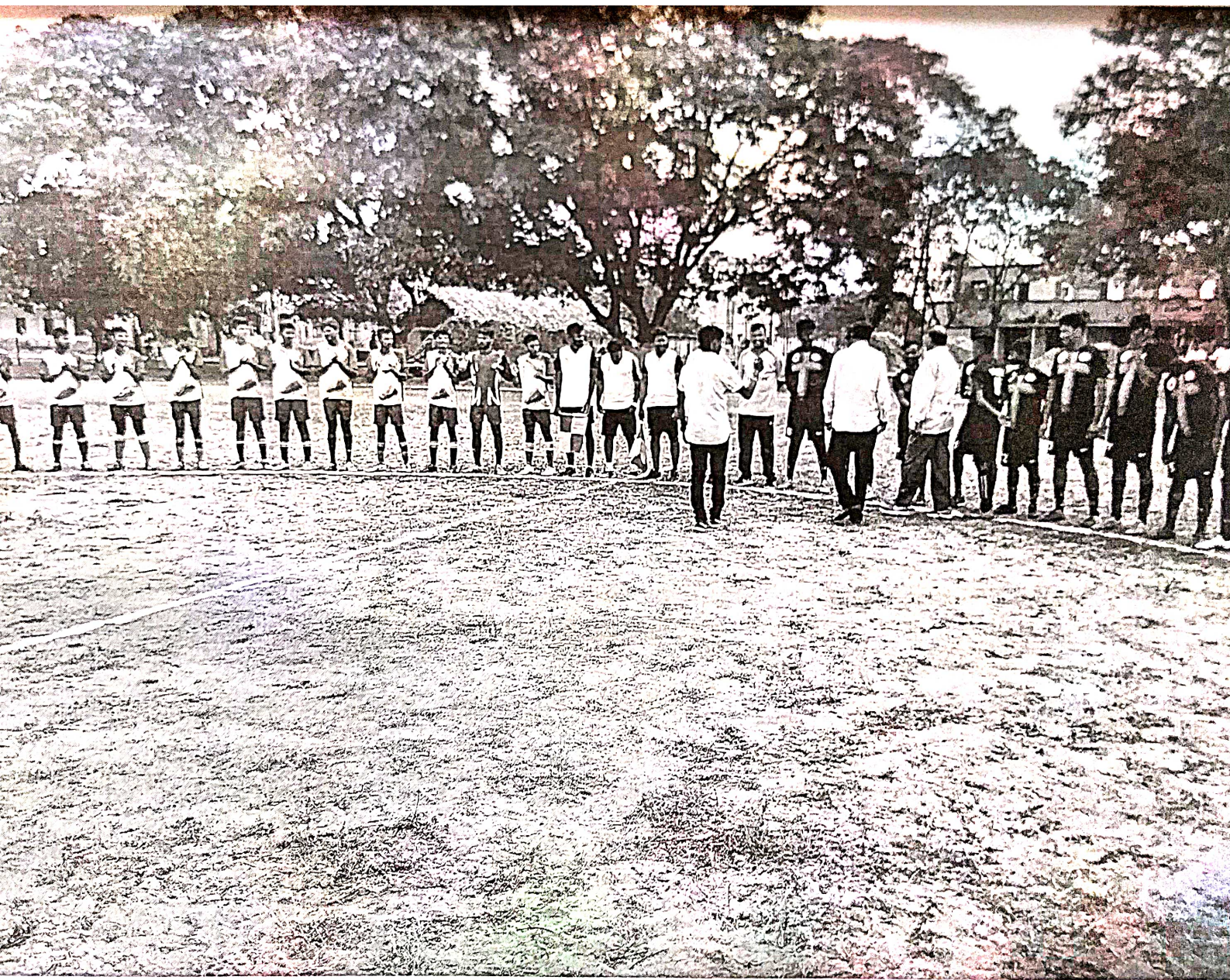
COLLEGE FOOTBALL TEAM